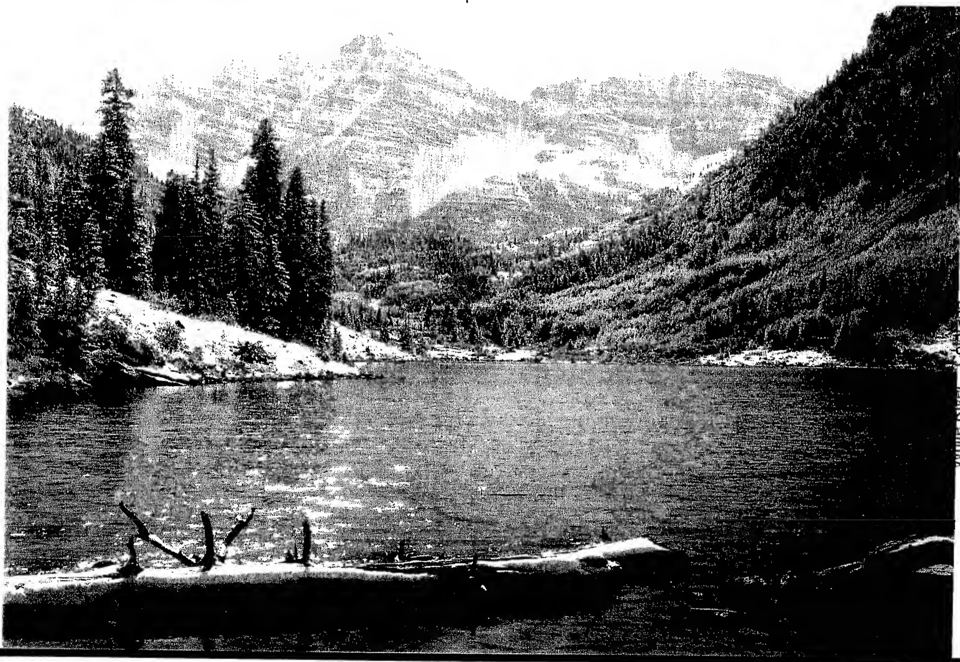
White River Colorado