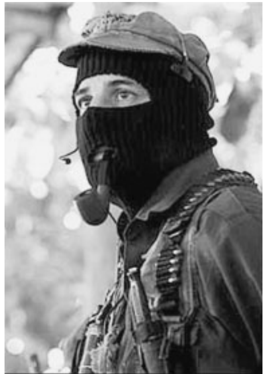
1. Subcommandante Marcos smoking his famous pipe in Mexico City, D.F., March 2001.