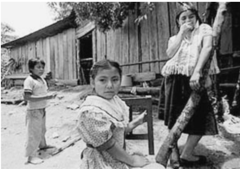
3. Three children playing in La Realidad, one of the Zapatista Autonomous Communities in Chiapas, Mexico, March 2001.